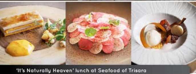
'It's Naturally Heaven' lunch at Seafood of Trisara