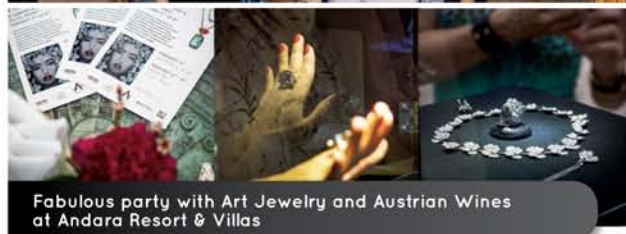
Fabulous party with Art Jewelry and Austrian Wines at Andara Resort & Villas

This unique 3 days 2 nights program features various luxury lifestyle experiences that can be tailored-made to match your desire, including 44 dishes pairing with 27 boutique wines from the Fin Naturally wine collection making ensuring the journey is an unforgettable one.