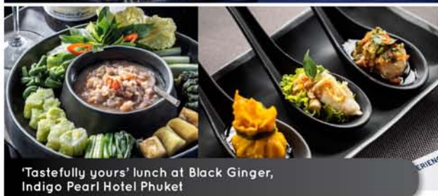
"Tastefully yours" lunch at Black Ginger, Indigo Pearl Hotel Phuket