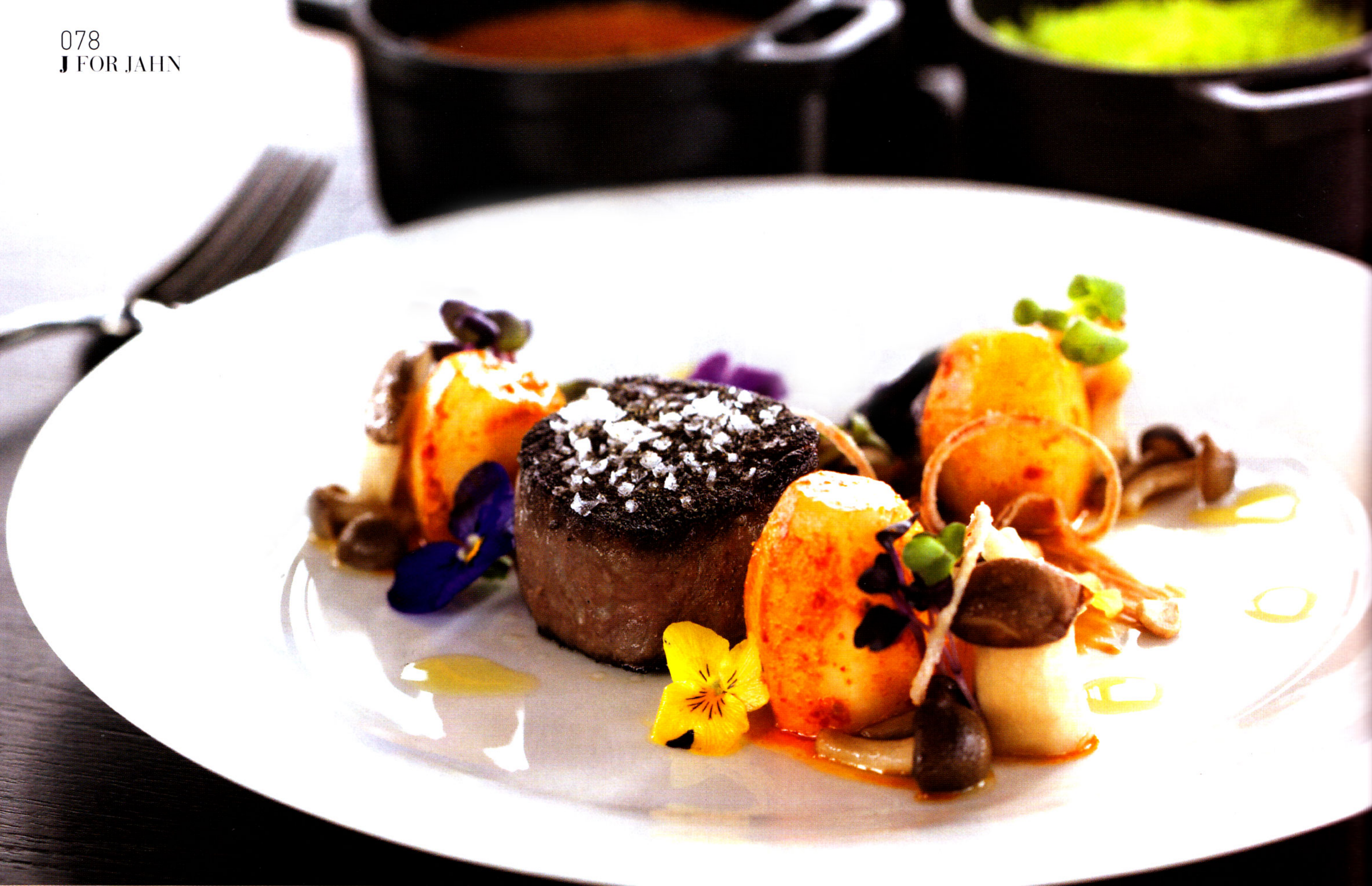
Massaman of Wagyu Beef with Pearl Onions, New Potatoes and Enoki Mushrooms